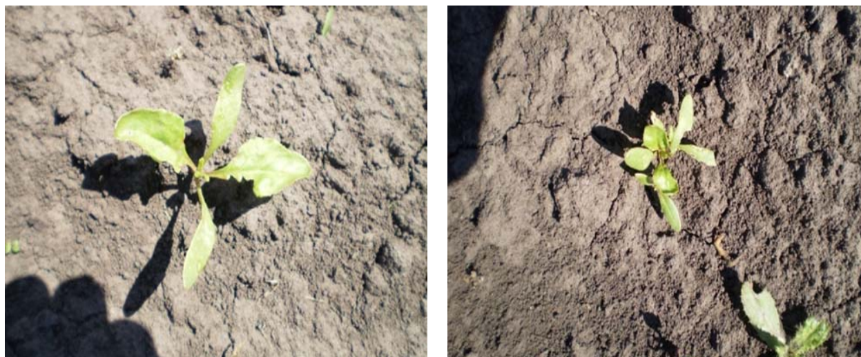
Figure 1 – Minor damage to plants by weevils and wireworms

Thus, at the Cherkasy Experimental Agricultural Station when sown with dragee seeds treated with Force Magna, weighed 40% of the plants with weevils, and a mixture of preparations of the Cruiser (60 bp/p.e.) + Force (8 bd/p.e.) - 20% of the plants with a damage score of less than 1 (about 5% destroyed leaf surface), while 80% of the plants were damaged in the control and the damage score was 3, that is, up to 25% of the leaf surface was destroyed.