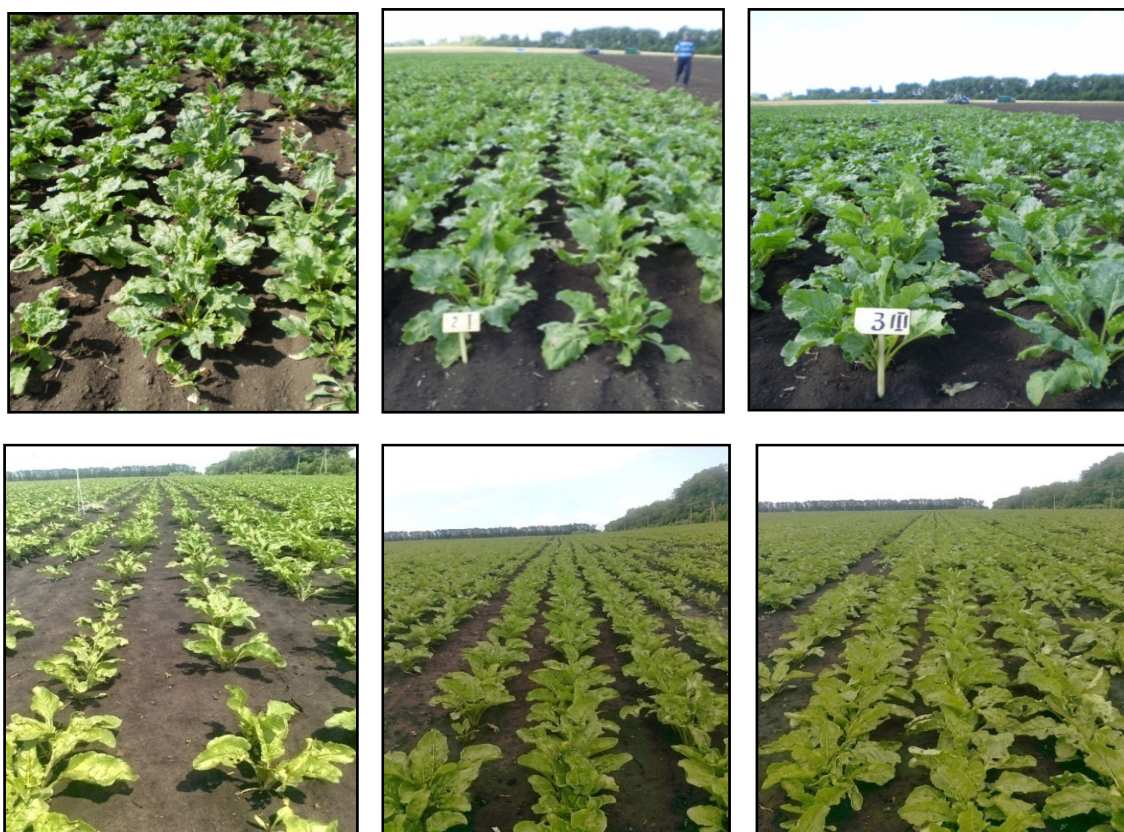
Figure 3 – General condition of crops

Upper row - Verkhnyatskaya ESS, 2010; lower – Archi LLC, 2011.